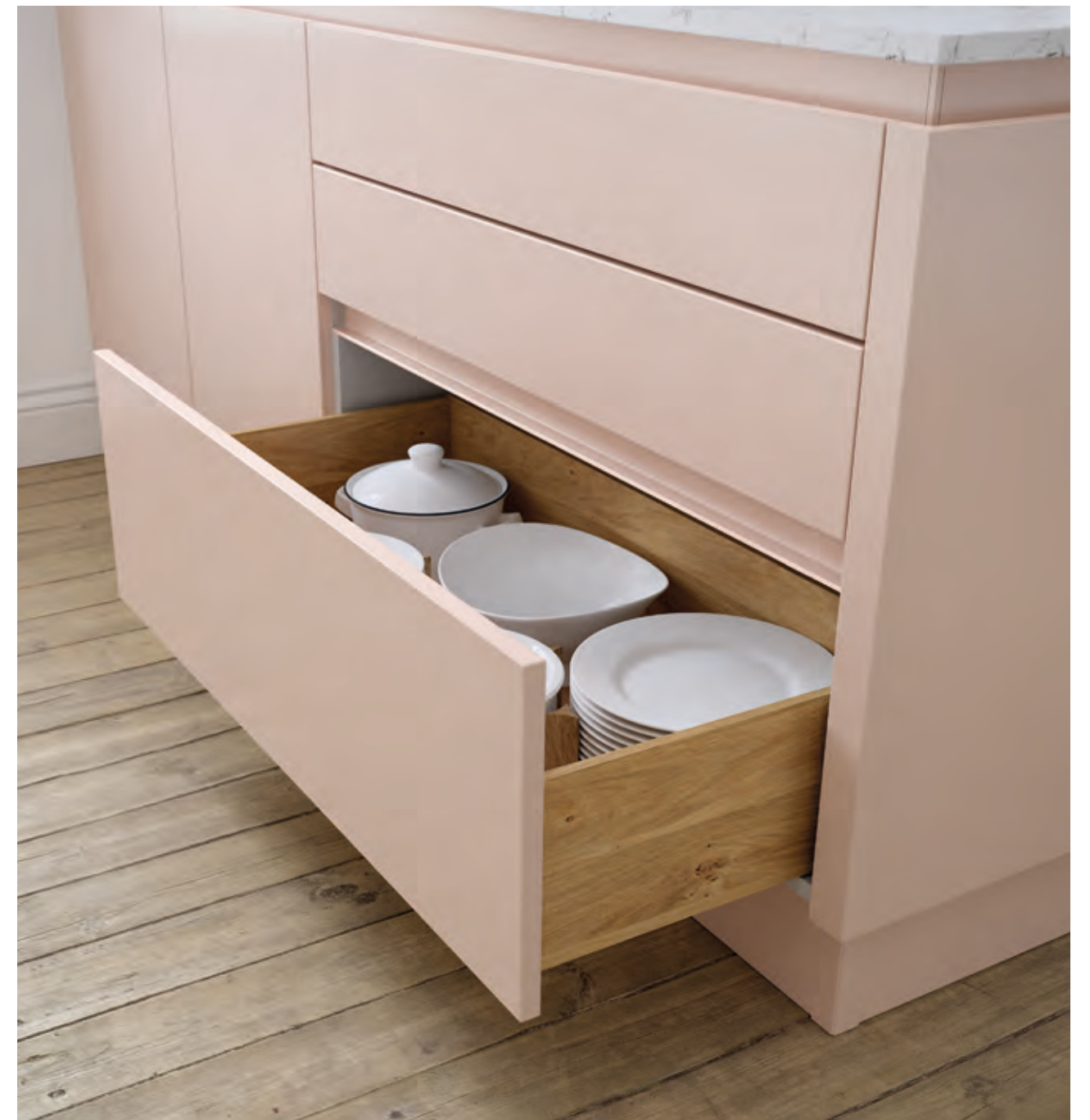
(left) Porcelain Matt paired with Dusky Pink. (above) Use oak dovetailed drawer boxes to contrast with the contemporary kitchen design. A simple touch which we feels gives it a homely look.