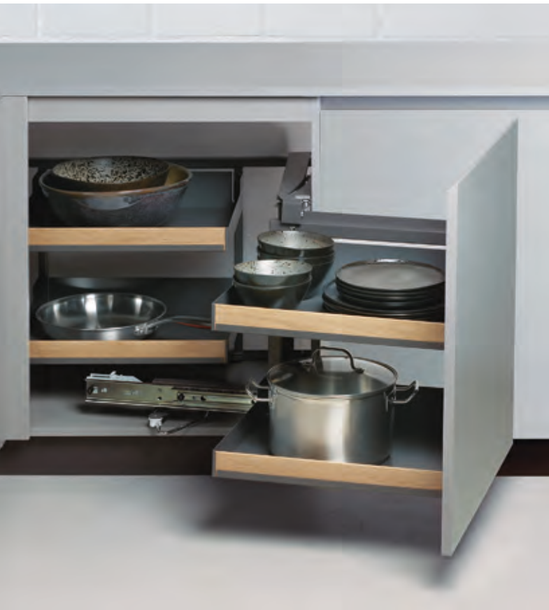
(From left to right) Libell Magic Wall Pull-Down in anthracite, 900mm wide. Libell Sliding Corner Pull-Out in anthracite, 450-600mm wide. Libell 300 Pull-Out in anthracite, 300mm wide. Libell 150 Pull-Out in anthracite, 150mm wide. Fioro Magic Corner in anthracite with oak panelling.