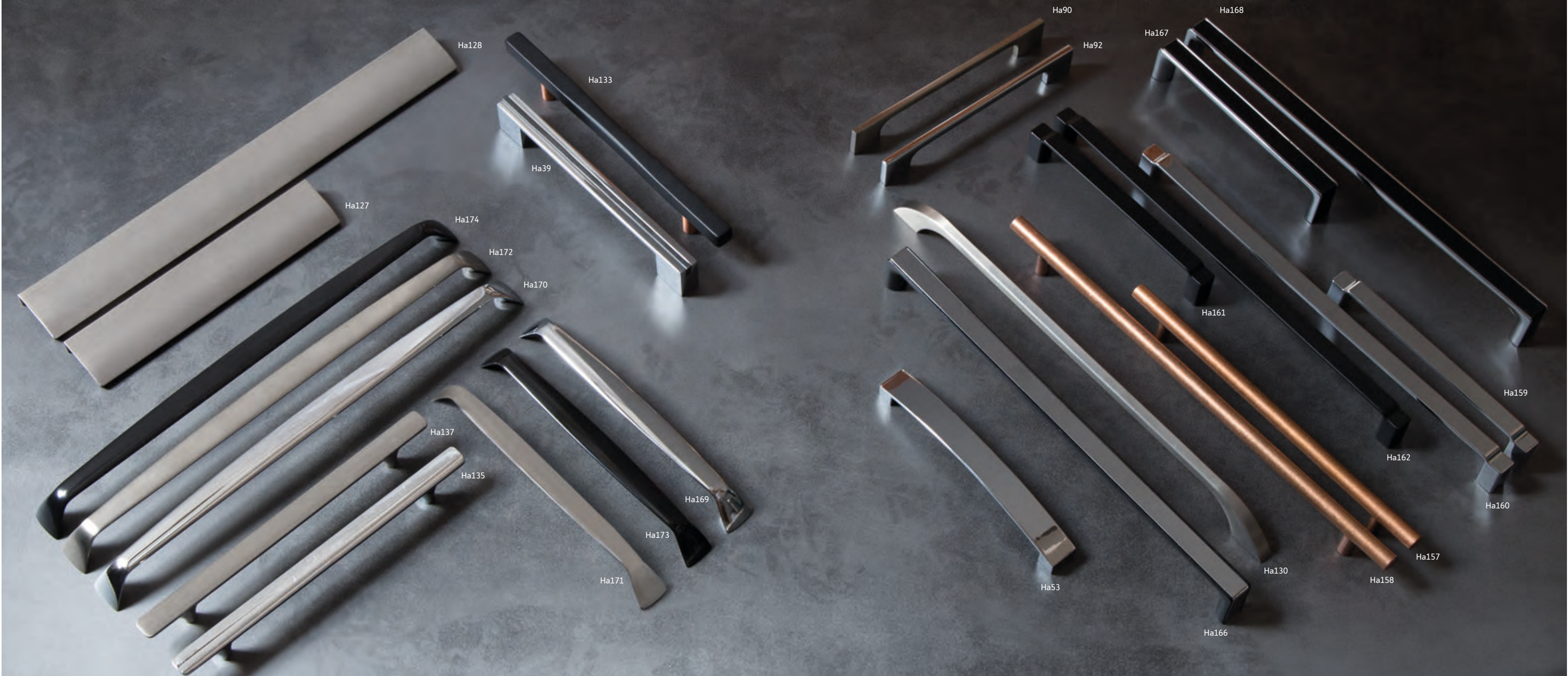
Ha128 Brushed Nickel Edge handle, 200mm centres. Ha127 Brushed Nickel Edge handle, 160mm centres. Ha174 Black D handle, 320mm centres. Ha172 Brushed Nickel D handle, 320mm centres. Ha170 Chrome D handle, 320mm centres. Ha169 Chrome D handle, 160mm centres. Ha173 Black D handle, 160mm centres. Ha171 Brushed Nickel D handle, 160mm centres. Ha137 Brushed Nickel D handle, 160mm centres. Ha135 Chrome D handle, 160mm centres. Ha39 Chrome/Grey square D handle, 160mm centres. Ha133 Black and Copper T-bar, 160mm centres. Ha90 Brushed Nickel D handle, 160mm centres. Ha92 Chrome D handle, 160mm centres. Ha53 Chrome bridge handle, 160mm centres. Ha166 Black/Chrome Twix handle, 320mm centres. Ha130 Brushed Nickel Slim handle, 320mm centres. Ha158 Copper T-bar handle, 320mm centres. Ha157 Copper T-bar handle, 197mm centres. Ha161 Black Matt square D handle, 160mm centres. Ha162 Black Matt square D handle, 320mm centres. Ha160 Chrome square D handle, 320mm centres. Ha159 Chrome square D handle, 160mm centres. Ha167 Black/Chrome Twix handle, 160mm centres. Ha168 Black/Chrome Twix handle, 320mm centres.

Finely designed and precision manufactured in a range of materials and finishes, our collection of handles includes something to suit every taste, and your selected style can greatly enhance your chosen kitchen.