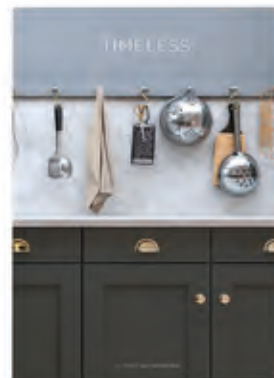
Timeless Range From shaker styles to in-frame, our Timeless range is the perfect match for more classic or rustic decor.

Visit fikitchens.co.uk to view the complete range