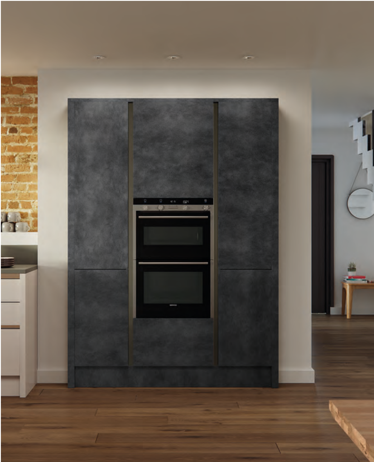
(below) Feature larder/oven housing unit in Foundry Charcoal (right) Island in Gloss Savanna and Silestone Kensho worktop.