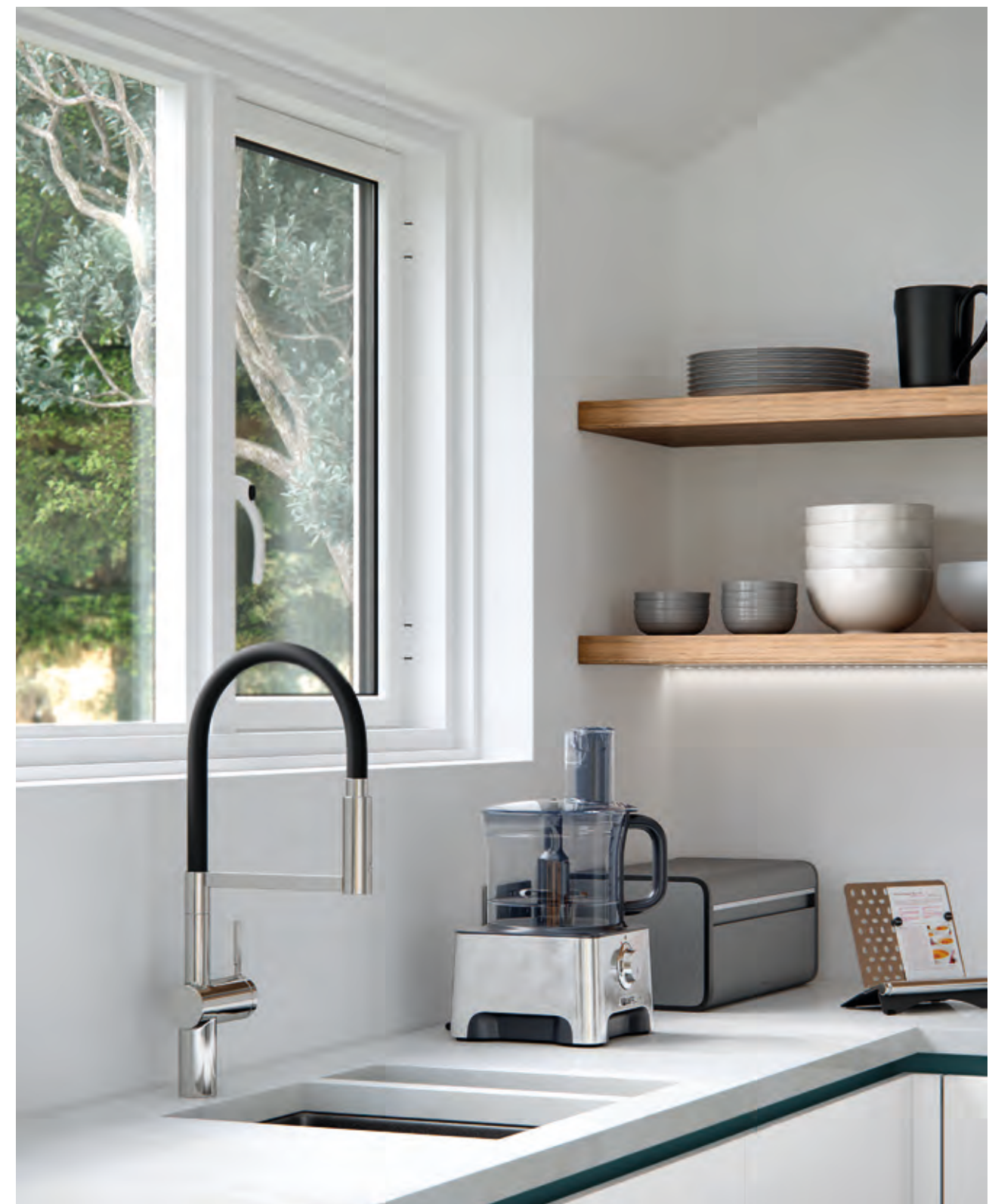
(left) The handle-less rail profile painted in Paradise Blue contrasts with the white and echoes the colour used on the island. (above) Decorative and practical, the oak shelving adds a visual interest while keeping convenient items within reach.