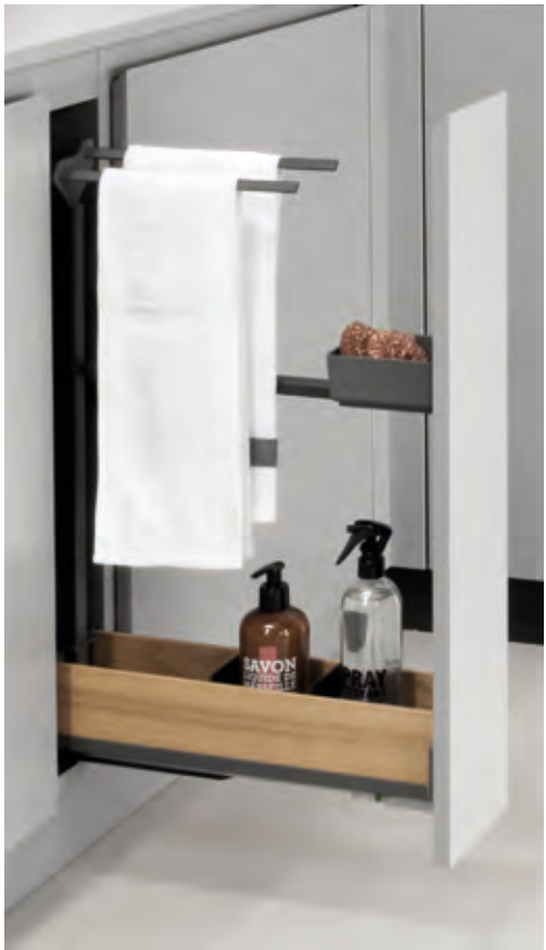
(From left to right) Fioro Pantry Larder in anthracite with oak panelling, 600mm wide. Fioro Larder Pull-Out in anthracite with oak panelling, 300/400mm wide. Fioro 150 Pull-Out with Towel Rail in anthracite with oak panelling, 150mm wide.