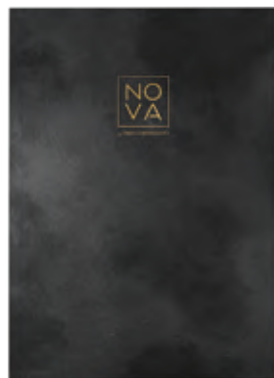
NOVA Range Showcasing a range of bespoke styles, the Nova brochure presents our modern kitchens in their most exclusive form.