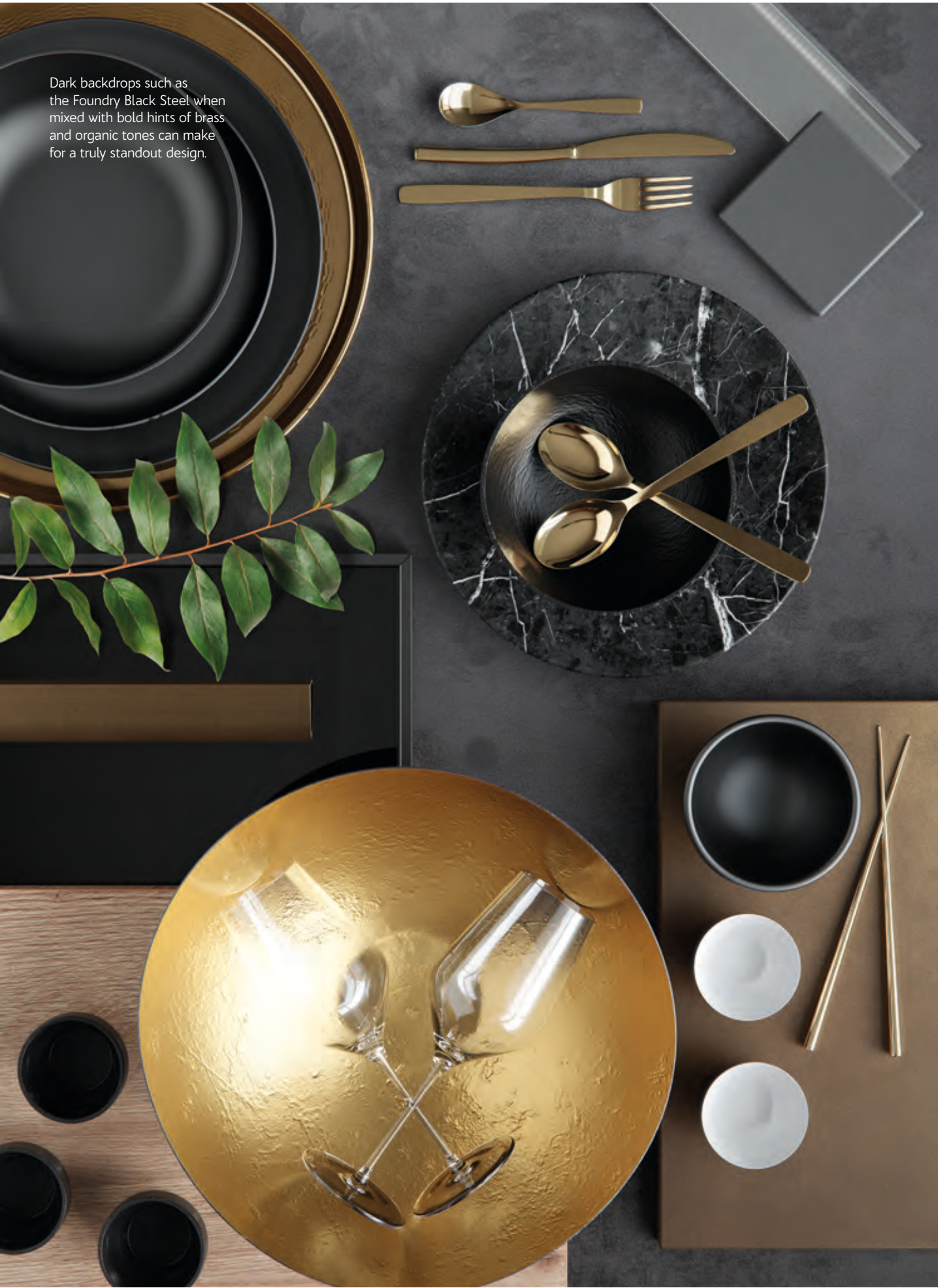
Dark backdrops such as the Foundry Black Steel when mixed with bold hints of brass and organic tones can make for a truly standout design.