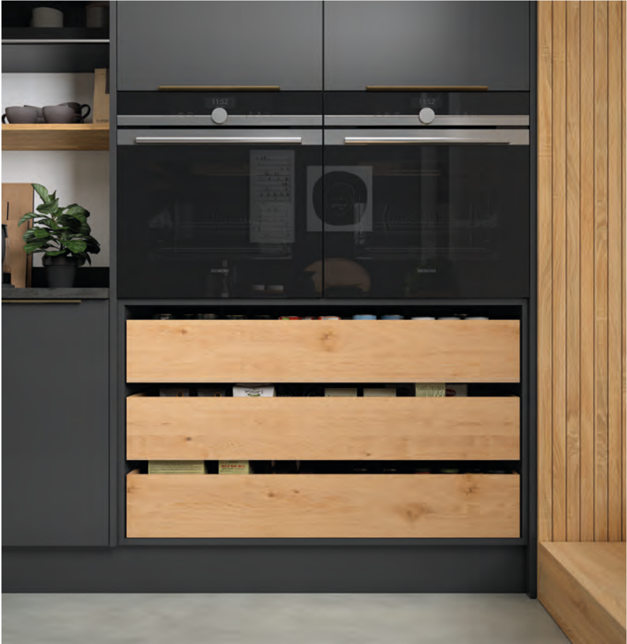
(below) The exposed oak drawers create a visual contrast and introduce warm tones to the kitchen. (right) Achieve a sleek look with subtle Edge handles, shown here in brushed brass (Ha206).