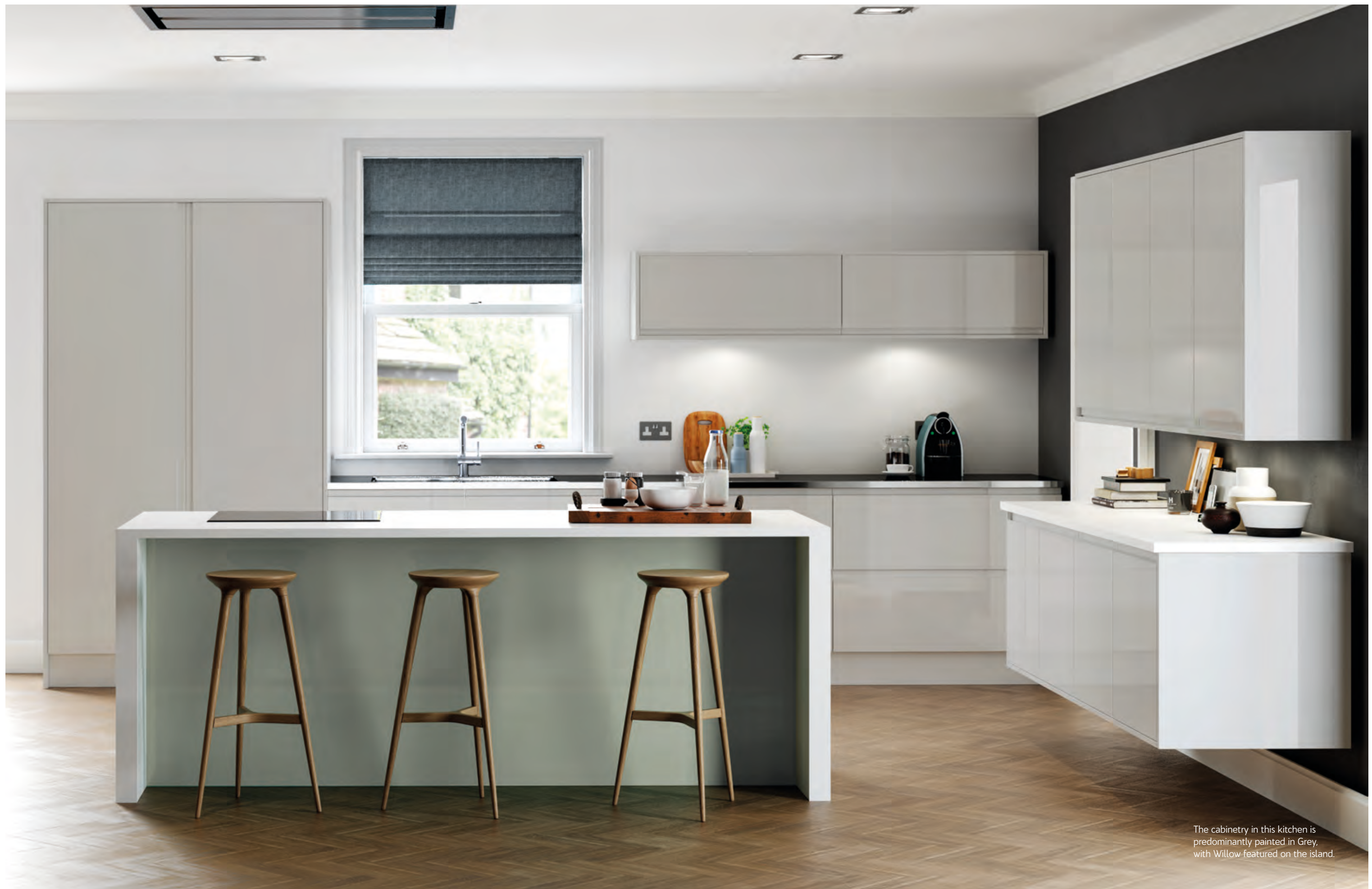
The cabinetry in this kitchen is predominantly painted in Grey, with Willow featured on the island.