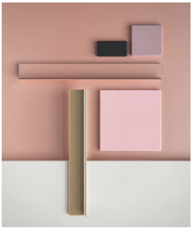
Pair pinks and shimmering finishes with handleless designs for a charming and fresh look.

Pink tones and shimmering finishes can highlight the smoothness of handleless designs, while dark backdrops such as Foundry Black Steel blend perfectly with brass and organic tones for a truly standout effect.