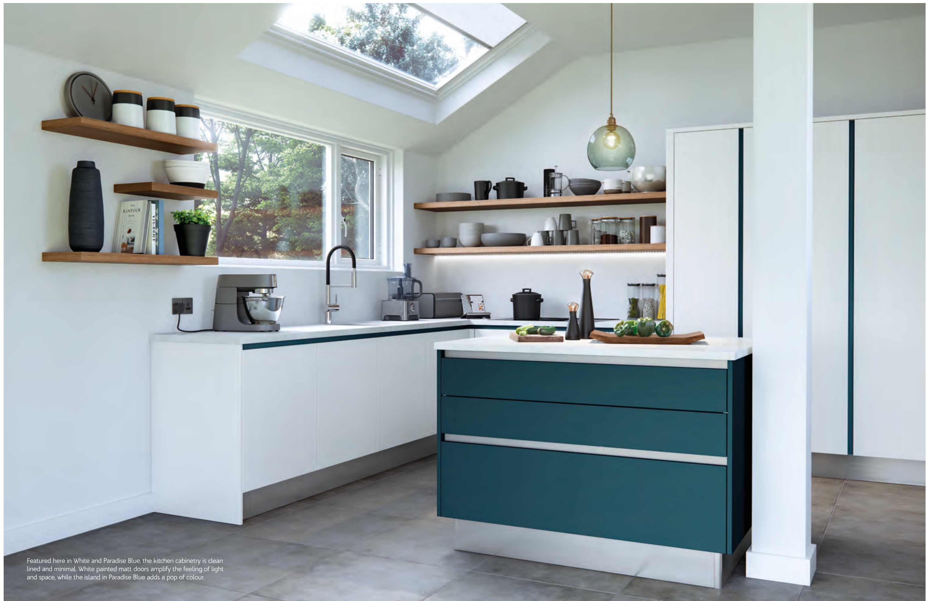
Featured here in White and Paradise Blue, the kitchen cabinetry is clean lined and minimal. White painted matt doors amplify the feeling of light and space, while the island in Paradise Blue adds a pop of colour.