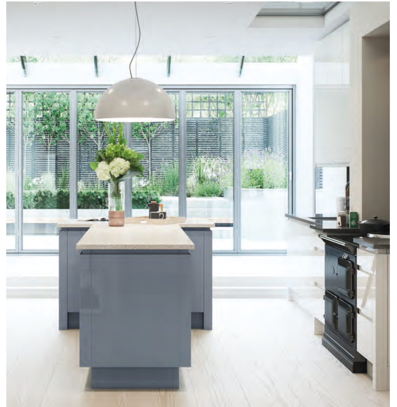
(left) Our Italian painted doors ensure that a deep glossy level is achieved. (above) Hidden handles help to make for a completely contemporary look, and the Welford gives you the freedom to experiment with colours and combinations.