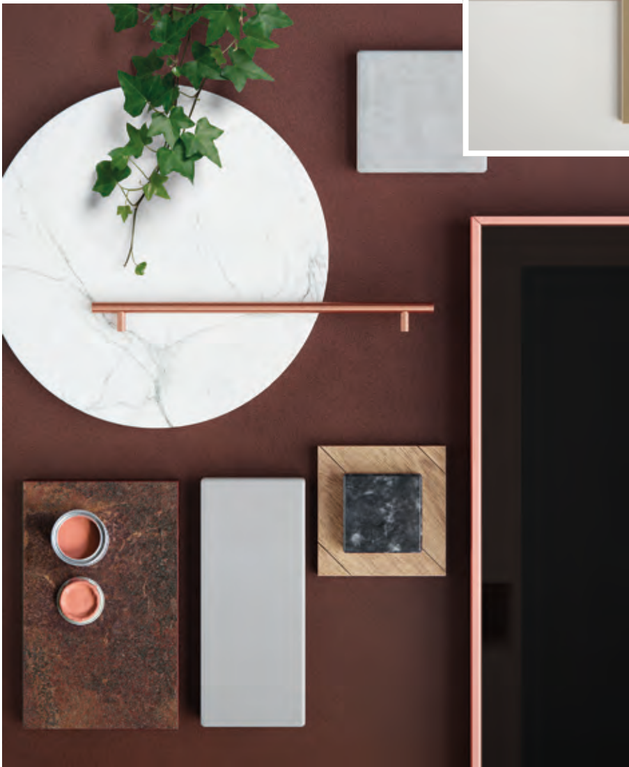
Introduce warmth by combining deep reds and coppers with greys and organic tones such as oak and stone.