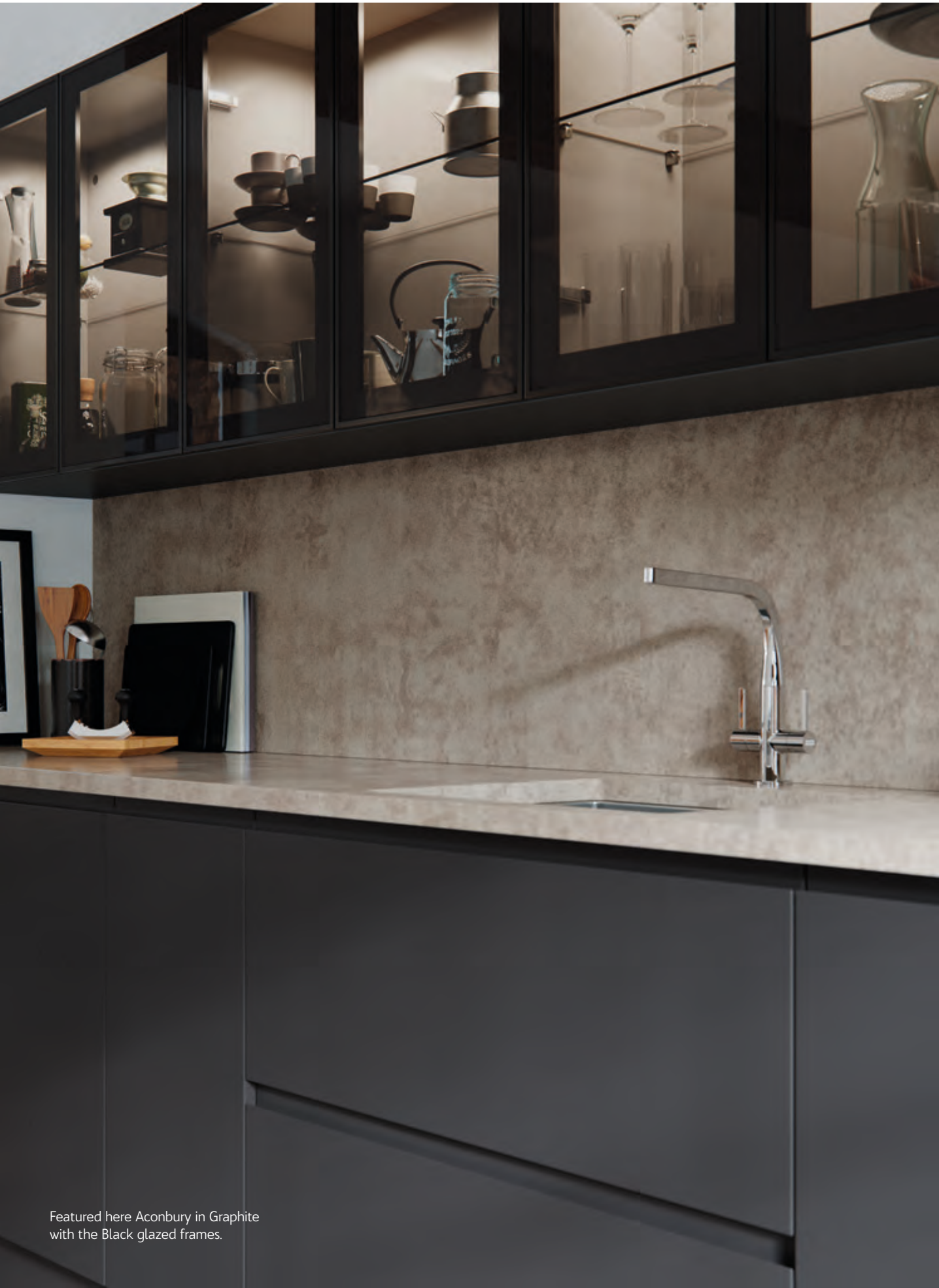
Featured here Aconbury in Graphite with the Black glazed frames.

Black Matt frames are available with black privacy glass.